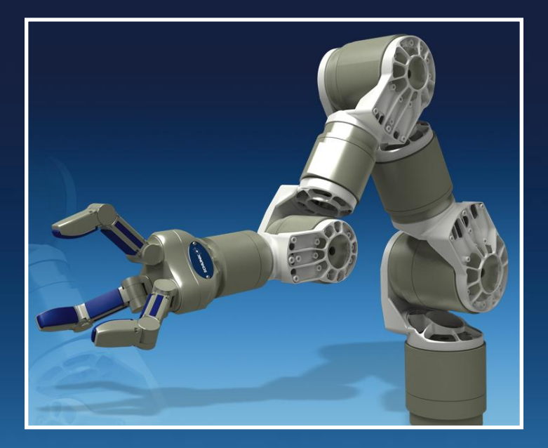
SCHUNK is the most sucessfull vendor for complex gripping devices